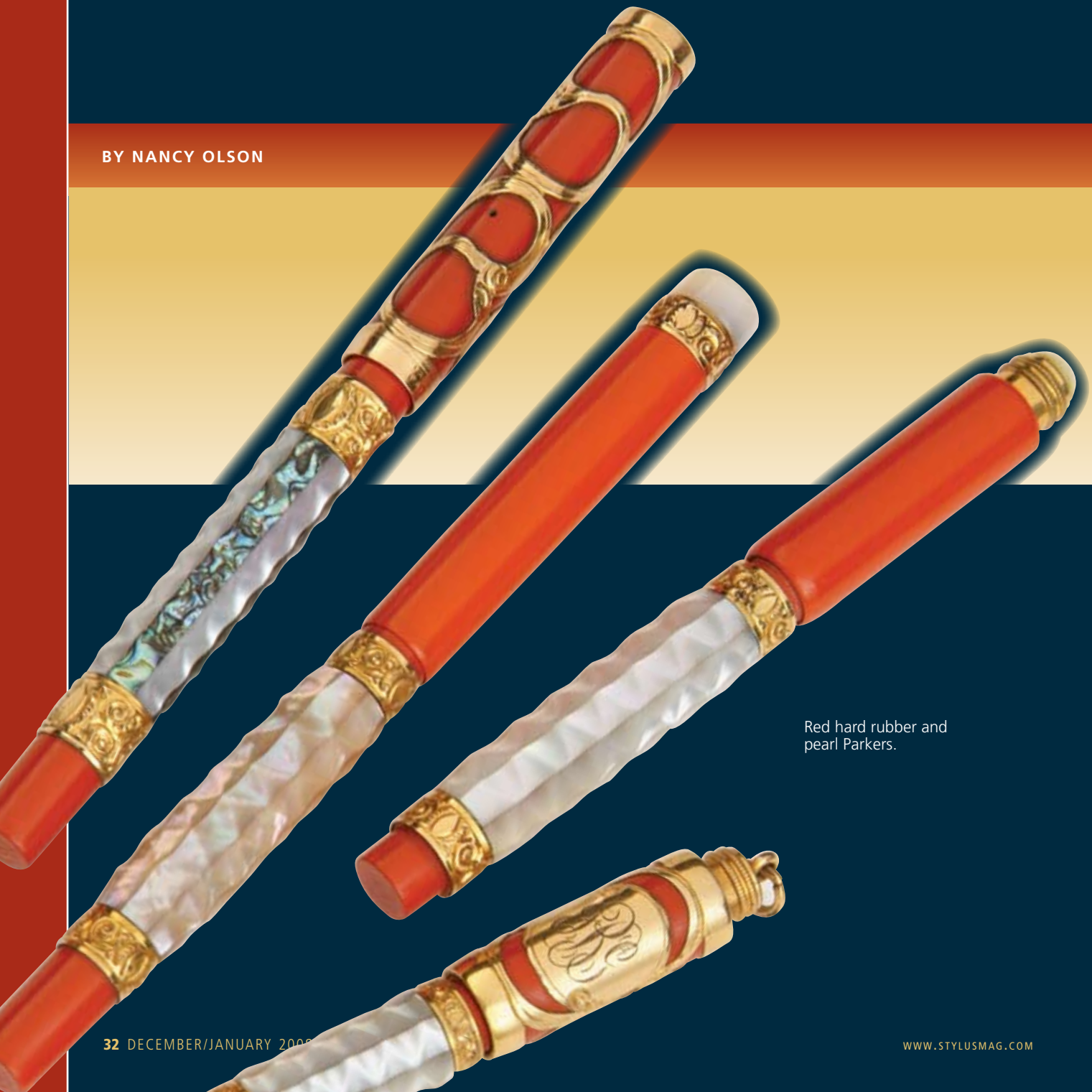
Red hard rubber and pearl Parkers.