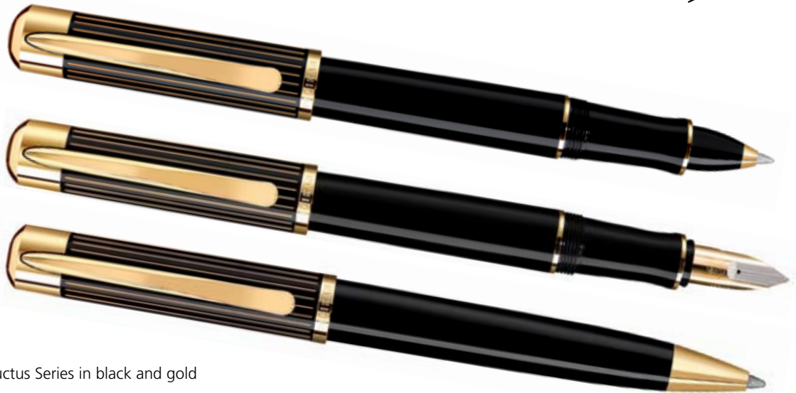
Ductus Series in black and gold

We believe that Pelikan has been able to distinguish itself by offering unique and distinctive pens that cater to pen enthusiasts, aficionados and pen collectors.