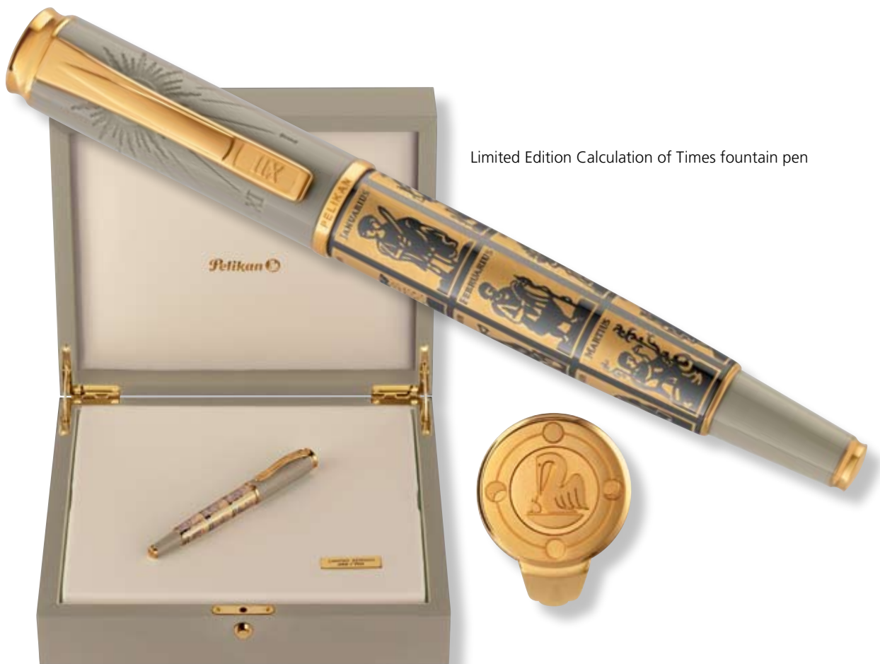
Limited Edition Calculation of Times fountain pen

position it as a preferred brand for those who appreciate the very best in fine writing instruments.